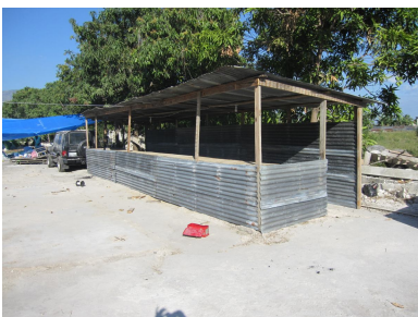
Newly built kitchen