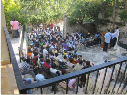
Sunday morning service at CCPAP. The congregation spills into the street behind the church building.

We are very thankful that no regular member of CCPAP was killed in the earthquake. The building is standing but its walls were cracked by the earthquake and therefore services must be held outside.