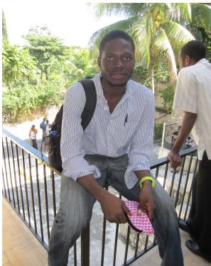
Young man from CCPAP whose mother died in the earthquake.

Unfortunately, many died during the earthquake in Haiti who did not have this hope.