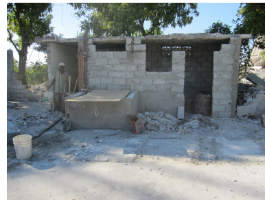
Building converted into showers