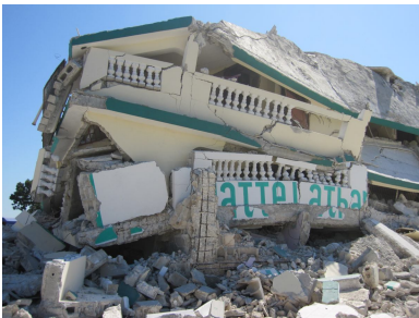
Demolished hospital from earthquake

During the week we were in PAP, this land was transformed by the hard-working Haitians into a sanitary tent city which is already being inhabited by the homeless members of the church.