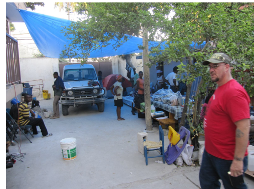
Backyard at CCF houses about 30 people

We were able to use the bathrooms in the orphanage, but those who experienced the earthquake went in with much anxiety. In fact, one worker asked for prayer that she could use the bathroom without fearing that the building would fall.