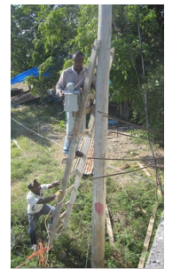
Electricity & lights