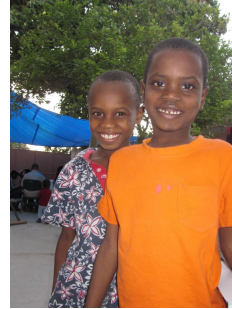
Letchino &amp; Loveson

the structure can be repaired with the placement of additional iron reinforced concrete pillars around the outside of these walls. We have already acquired the materials for this repair but we are following the advice of experts who say to delay all construction until 30 days after the earthquake. The aftershocks can apparently weaken new construction.