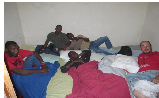
Sleeping in close quarters at CCF