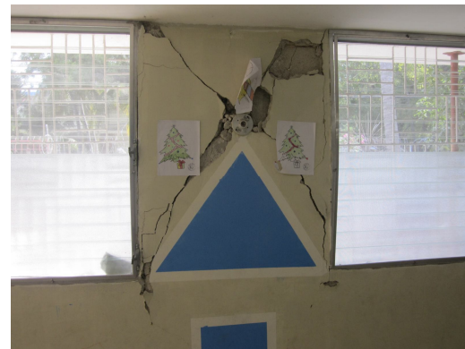
Damaged supporting wall at CCF