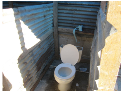
Newly installed toilets (5 total)