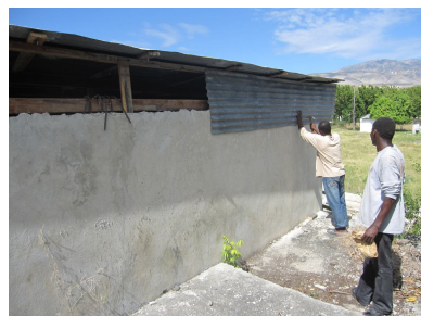
Building converted into food storage