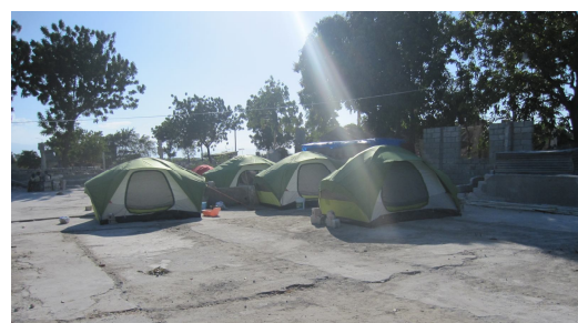
The first of many more tents to be inhabited